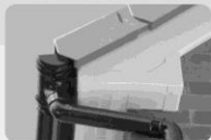
Fascias and Soffits