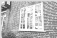
Windows and Doors