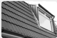
Roofing and Guttering